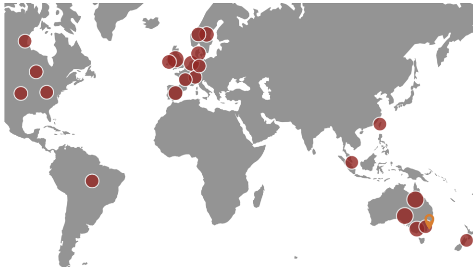
Fig 2. Collaboration on research papers (countries)